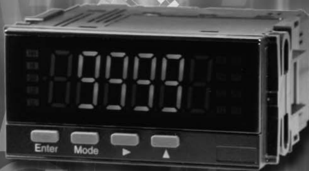
Display single type (A6X2X-XX)