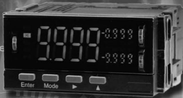
Display multi type (A6X1X-XX)